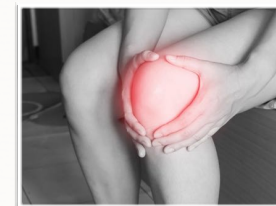
RELEIF from JOINT PAINS

Sahiwal Cow A2 VEDIC Ghee is rich in omega 3 and Omega 6 fatty acids and has far superior immunity-building properties than any other type of ghee available on the shelf.