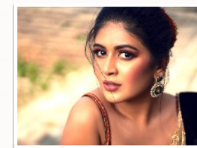
MANAGES HAIR & SKIN

HONEY Helps you in getting sound SLEEP consume 1-2 teaspoon ( 6-12g ) with WARM WATER OR MILK. Honey helps your brain release MELATONIN, the hormone that your body uses to restore itself during sleep. This happens through a series of transformations in your brain: honey's sugars spike your insulin levels, releasing tryptophan, which becomes serotonin, and finally MELATONIN