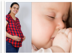
Excellent for PREGNANT & LACTATING MOTHERS