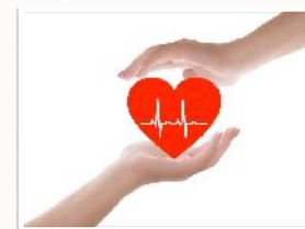
LOWERING RISK OF HEART DISEASE

HONEY prevents ACID REFLUX - Honey is both antioxidant and free radical scavenging. Reflux may be caused in part by free radicals that damage cells lining the digestive tract. Relief from heartburn symptoms after consuming 6 ml (about one teaspoon) of plain honey.